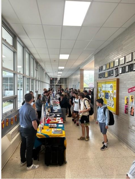
Mini College Fair